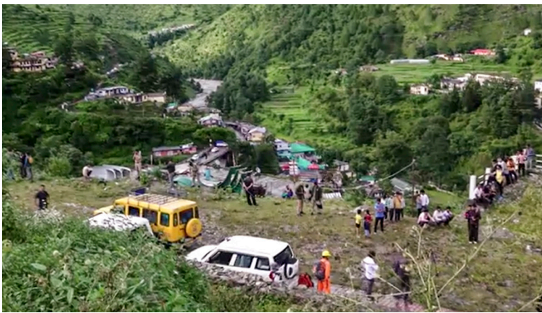
Rescue operations in flood-hit areas were affected after a portion of a road collapsed near Bhatwari in Uttarkashi district of Uttarakhand on Wednesday.

One of the bodies has been identified as that of 35-year-old Akash Panwar, according to the Disaster Control Room in Uttarkashi. The disaster was caused by a cloudburst on Tuesday afternoon. The sudden downpour brought massive