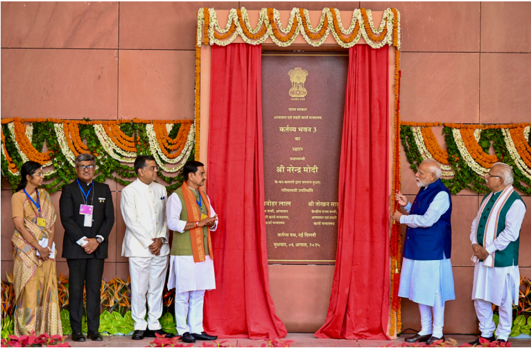
Prime Minister Narendra Modi with Union Minister of Housing and Urban Affairs Manohar Lal Khattar and Union MoS for Housing and Urban Affairs Tokhan Sahu during the inauguration of Kartavya Bhavan-3 in New Delhi on Wednesday.

By uniting numerous ministries and departments that are currently dispersed throughout Delhi, Kartavya Bhavan-03 is intended to promote efficiency and cooperation. The office complex spans approximately 1.5 lakh square meters over two basements and seven levels (ground plus six floors). It will house the offices of the Ministries of Home Affairs, External Affairs, Rural Development, MSME, Petroleum & Natural Gas, DoPT, and the Principal Scientific Adviser (PSA).