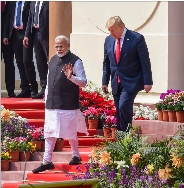
A file photo of Prime Minister Narendra Modi and US President Donald Trump.

Stressing that he found that India was directly or indirectly importing Russian oil, the order said Indian imports into the US should be subject to the additional tariff 21 days after the date of the latest order. Goods that were already in transit on the final mode of transit prior to entry