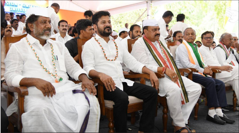
Telangana CM Revanth Reddy participated in a dharna in favour of 42 per cent reservation for backward classes at Jantar Mantar in New Delhi on Wednesday, along with other INDIA bloc leaders.