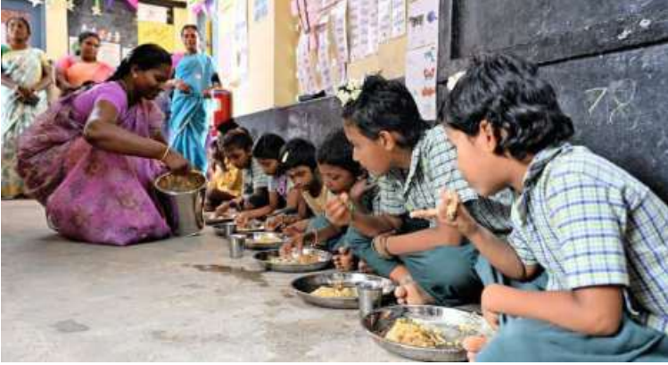
Step by step: The Tamil Nadu government’s breakfast scheme is among the many measures taken to improve access to education for the marginalised. FILE PHOTO

At every stage, from primary school to research, students receive scholarships that ease the financial pressures and help them stay in school. Free education, textbooks and uniforms further re-