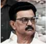
M.K. Stalin Chief Minister of Tamil Nadu

As the State proudly sends off another batch of students from the most disadvantaged backgrounds to the most prestigious educational institutions in the country, one must look back at Tamil Nadu’s legacy in pushing to make education accessible to all; the success stories are not isolated, they reflect a systemic change