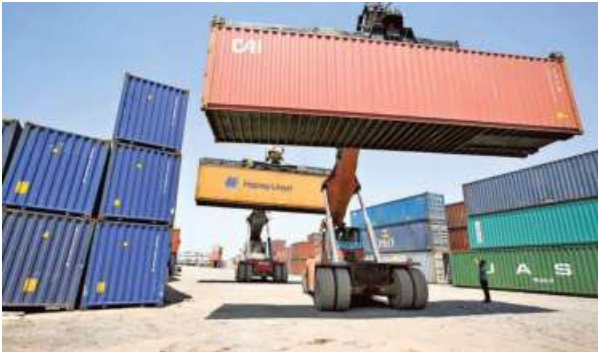
Pharmaceutical products and electronics have also been excluded from the 25% tariff on Indian goods. FILE PHOTO

However, the executive order he signed thereafter only gives effect to the 25% tariff on Indian goods coming to the U.S. Even this has an exclusion list that includes finished pharmaceutical products (tablets, injectables and syrups), active pharmaceutical ingredients, electronics and ICT goods (semiconductors,