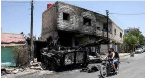
Hundreds gathered in Syria's Druze heartland on Friday to demand the withdrawal of government forces after deadly sectarian violence last month and the opening of an aid corridor from Jordan. Sweida has seen tough humanitarian conditions since week-long clashes killed around 1,400 last month, according to a war monitor.

Words are important, and can often lead to unintended consequences, says U.S. President; he does not specify if he meant nuclear-powered or nuclear-armed submarines; neither does he elaborate on the locations, kept secret by the U.S. military