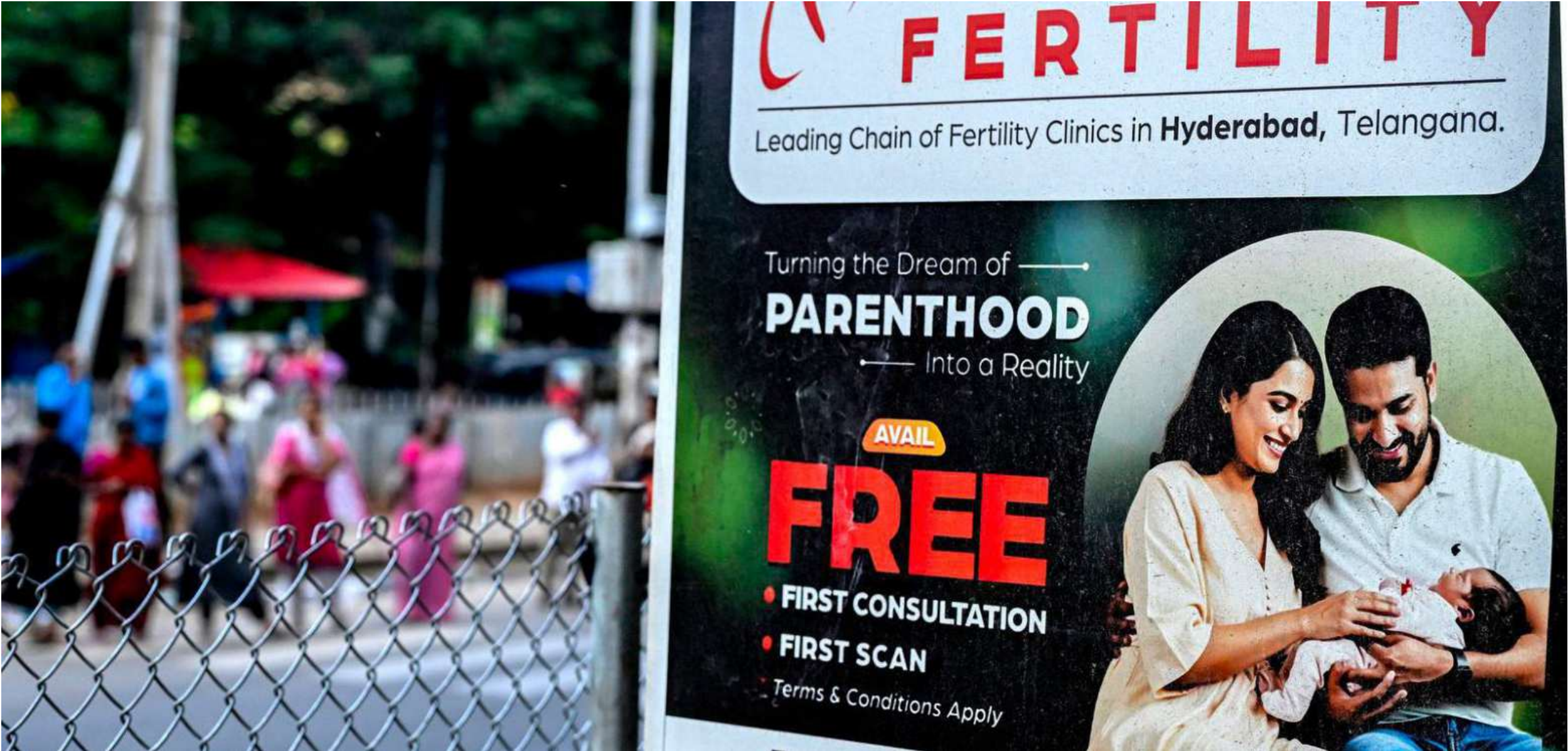
Billboards advertise fertility centres in Hyderabad. The city, along with Secunderabad, is a significant hub for medical tourism in India. G. RAMAKRISHNA