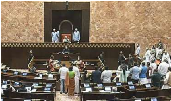
Uproar in House: Rajya Sabha Deputy Chairman Harivansh conducts proceedings in the House amid protest on Friday.

ter and the rules of this House are very clear. I cannot allow [a discussion],” he said, urging the protesting members to return to their seats. The House was then adjourned till noon.