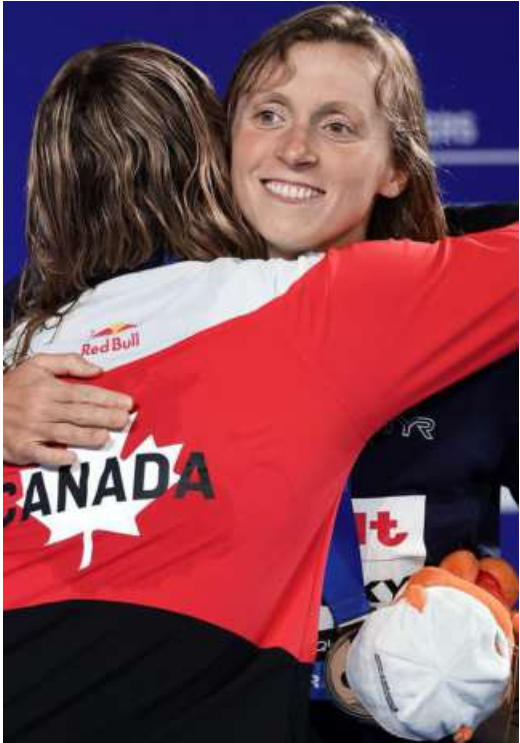
SUMMER MCINTOSH AND KATIE LEDECKY

the 28-year-old’s mark recently, signalling the chance that fans could soon see a changing of the guard. McIntosh famously ended Ledecky’s 13-year unbeaten streak in the event in 2024, when she bested the American by nearly six seconds at a sectionals meeting in Orlando, Florida.