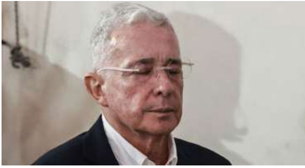
A Colombian judge on Friday sentenced still-powerful former president Alvaro Uribe to 12 years of house arrest, capping a long and contentious career that defined Colombian politics for a generation. Mr. Uribe, aged 73, received the maximum possible sentence after being found guilty of witness tampering.