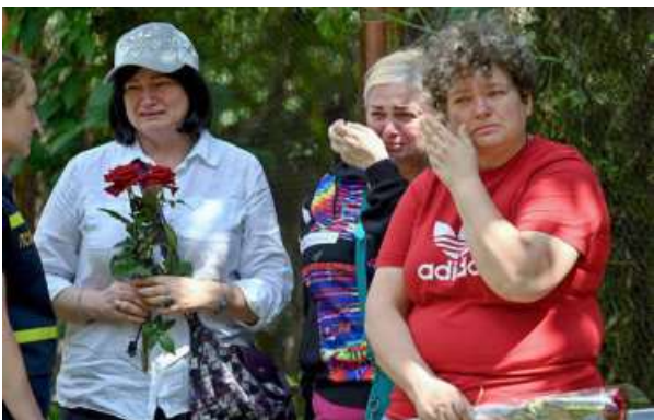
Women cry in front of a residential building in Kyiv on Friday, that was destroyed in a Russian strike in the previous morning.

Ukrainian rescuers recovered more than a dozen more bodies from the rubble of a collapsed apartment block in Kyiv overnight, bringing the death toll from Russia's worst air strike of the year on Ukraine's capital to 31. A two-year-old was among the five children found dead after Thursday's sweeping Russian drone and missile attack, President Volodymyr Zelenskyy said on Friday, announcing the end of a more than 24-hour-long rescue operation. A total of 159 people were wounded in the multi-wave strike, in which Russia launched more than 300 drones and eight missiles early on Thursday, the latest in a campaign of fierce strikes on Ukrainian