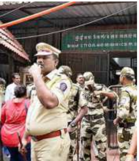
Police personnel outside the City Civil and Sessions Court in Mumbai ahead of the NIA special court’s verdict in the Malegaon blast case.

In a 1,036-page judgment acquitting all seven accused in the 2008 Malegaon blast case delivered on Thursday and made available a day later, Special Judge A.K. Lahoti criticised the National Investigation Agency (NIA) for presenting what it called “inconclusive”, “unreliable” and “legally inadmissible” evidence.