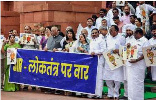
Matter of discussion: Mallikarjun Kharge, Priyanka Gandhi and other leaders protesting on Parliament premises on Friday.

“We believe that vote theft has happened at the State level [in Maharashtra]. Voter revision had happened and one crore voters were added. Then