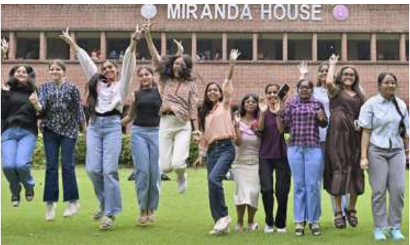
New beginnings: First-year undergraduate students at Delhi University's Miranda House on Friday.

The special drive was initiated after residents, including prominent citizens, took to social media to criticise the MCG for the civic mess.