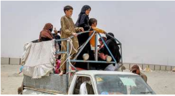
Pakistan issued a new call on Friday for Afghans living in the southwest to leave the country, triggering thousands to rush to the border. A deportation drive first launched in 2023 was renewed in April when Pakistan's government rescinded thousands of permits for Afghans, threatening to arrest anyone who did not leave. AFP