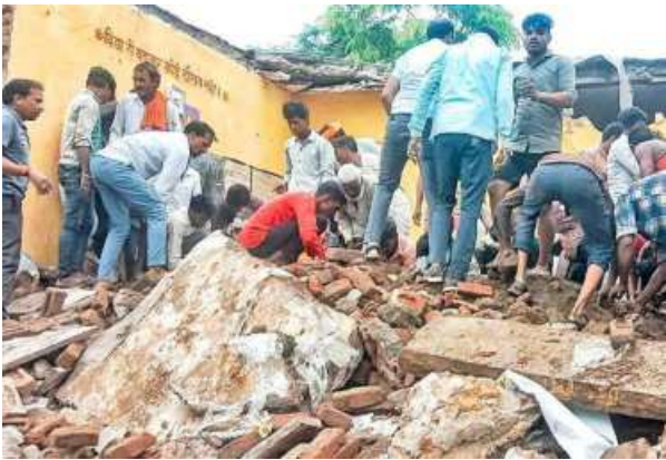
Locals helping in rescue work after a government school building collapsed in Rajasthan's Jhalawar district. FILE PHOTO