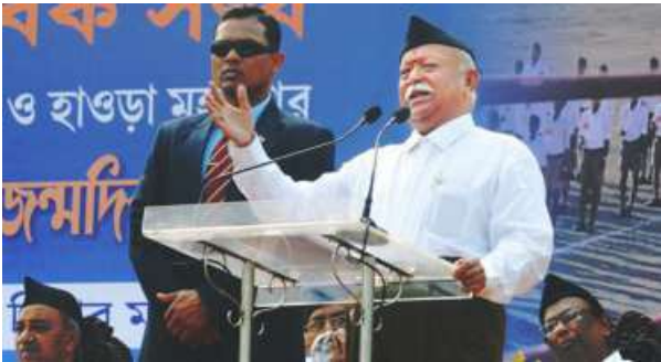
RSS chief Mohan Bhagwat. FILE PHOTO