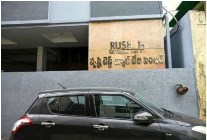
A view of the Srushti Fertility Centre in Secunderabad.

surrogacy for ₹10 lakh, say police reports.