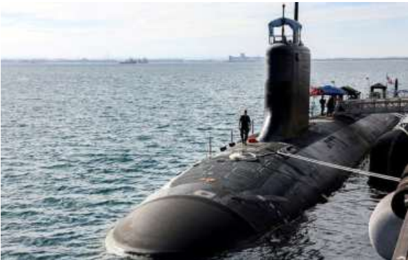
The U.S. keeps nuclear-armed submarines on patrol as part of its nuclear triad of land, sea and air-launched weapons.

U.S. President Donald Trump said on Friday that he had ordered the deployment of two nuclear submarines in response to "highly provocative" comments by a senior Russian official. "Based on the highly provocative statements of the Former President of Russia, Dmitry Medvedev..., I have ordered two Nuclear Submarines to be positioned in the appropriate regions, just in case these foolish and inflammatory statements are more than just that," Mr.