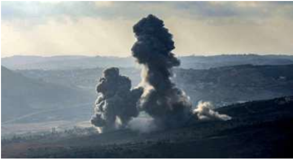
A series of Israeli air strikes killed four in south and east Lebanon, the Health Ministry said on Friday, referring to strikes that occurred the previous evening. The Israeli military said it targeted Hezbollah "infrastructure that was used for producing and storing strategic weapons" in south Lebanon and the eastern Bekaa Valley.